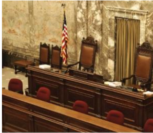
G-4 Planning Directives